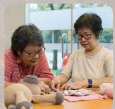
Hama Bead Craft